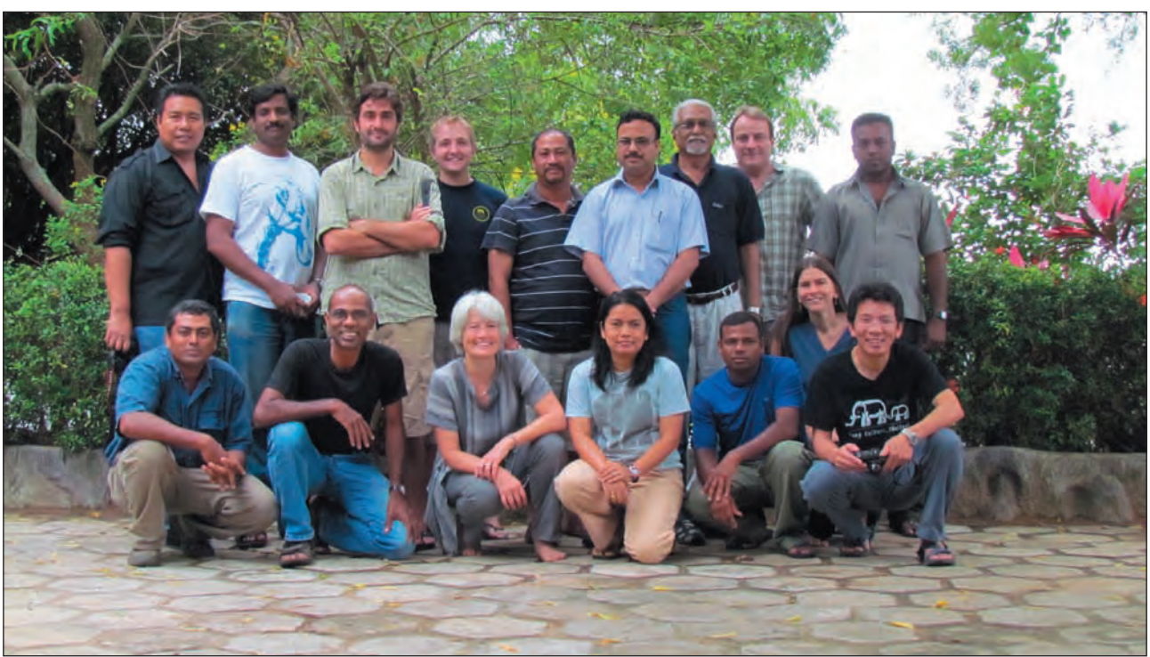
Figure 2. Group photo of first ECG study tour/technical exchange in Sri Lanka, March 2011.

Sukumar R (2003) The Living Elephants . Oxford University Press, Oxford.