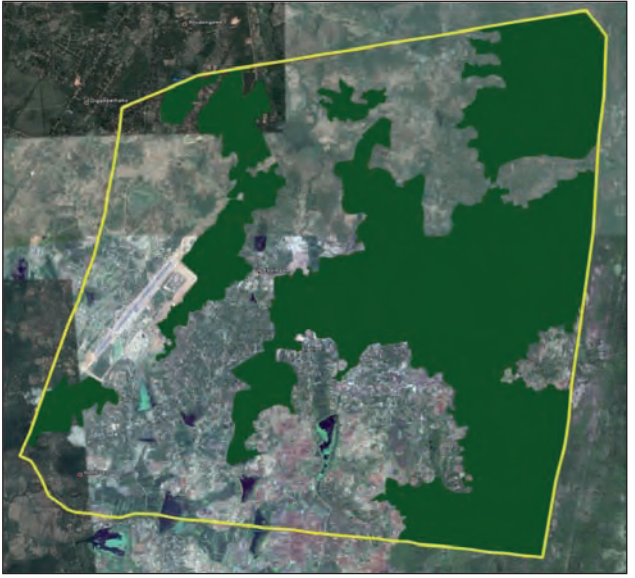
Figure 1. Land use pattern in the Sigiriya Sanctuary based on Google Earth imagery.

Yala cultivation provided an income ranging from Rs. 12,000-2,500,000 (US$ 120-25,000)